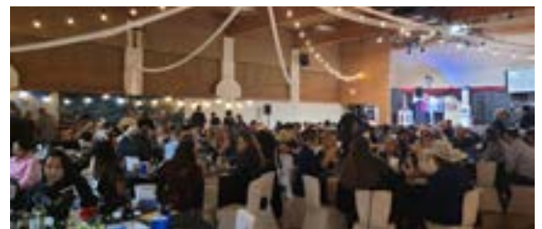
The enjoyable and well attended Business Excellence Awards evening was held on Saturday, October 26.