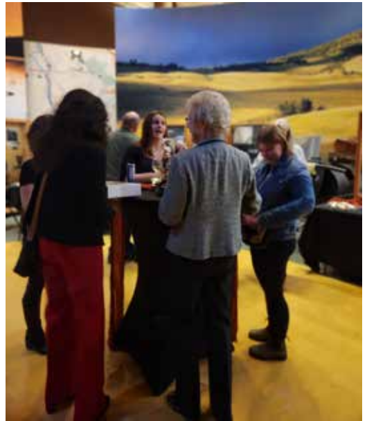
Great food, drinks and conversations at the Fall Social held Oct. 20 at the TDC

Thank you for your ongoing support, and we look forward to another year of growth, collaboration, and success!