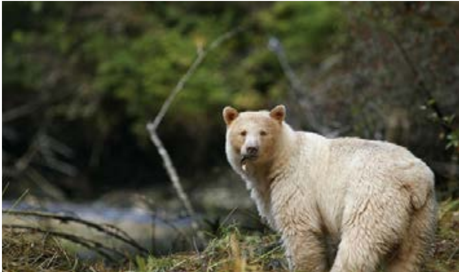
Spirit Bear | Douglas Neasloss

Start planning for your bucket list vacation by downloading a free travel guide from www.landwithoutlimits.com for more inspiration. For full story and supporting links, visit https://landwithoutlimits.com/stories/fill-your-2022-bucket-list-in-the-cariboo-chilcotin-coast/ .