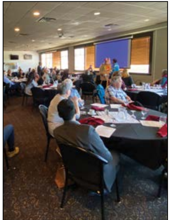
Members enjoying one of the many Chamber member events hosted every year!