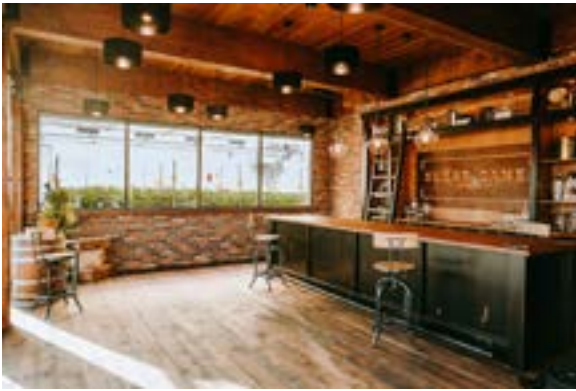
Photo of Sugar Cane Cannabis interior

is also receiving significant renovations in 2022) This trail was the first executed trail in the WLFN Trails Master Plan, also created in 2021 by First Journey Trails.