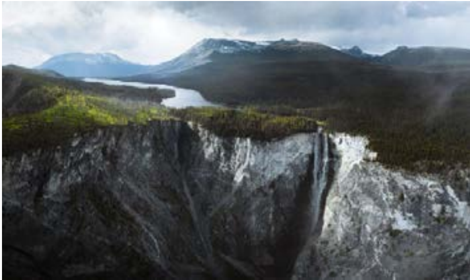
Hunlen Falls | Jesaja Class

Is 2022 the year of your epic vacation? What could be better than a trip to the wide-open spaces of the Cariboo Chilcotin Coast - where unique experiences, adrenaline-filled adventures, and natural wonders are in full supply! To help you curate your next incredible getaway from the everyday, we've put together a list of some of the most bucket-list-worthy excursions and experiences throughout the region. For full story and supporting links, visit our website landwithoutlimits.com .