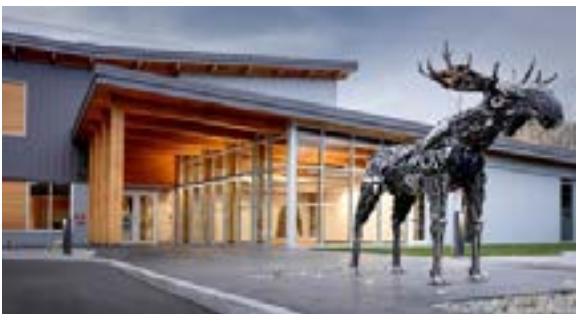
Photo of WLFN's new administration building at Quigly Drive

WLFN has committed over $20 million towards capital projects over the last 24 months, including WLFN's new government administration building, Sugar Cane Cannabis (BC's first farm-to-gate cannabis cultivation facility on IR6 near South Mackenzie), flood mitigation projects