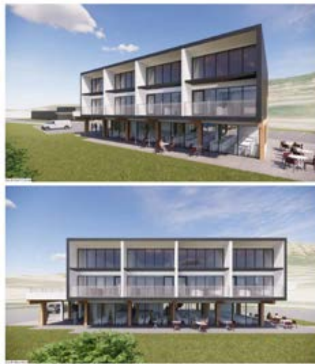
Photo of proposed Osprey Nest project at IR6

Despite the lingering effects of COVID-19 across the globe, WLFN remained relentless in achieving ideal outcomes in a variety of innovative projects and initiatives. Moving into the new WLFN government administration building in the Coyote Rock Real Estate Development was a milestone moment that the entire region can be very proud of. The vision of former and current leaders alike, this modern 18,000 sq. ft. building has proven to be an incredibly versatile facility that can properly host a Prime Minister (check!) or delegation, provides a platform for collaboration with staff, citizens, elders, and community members, and officially commits WLFN to a path