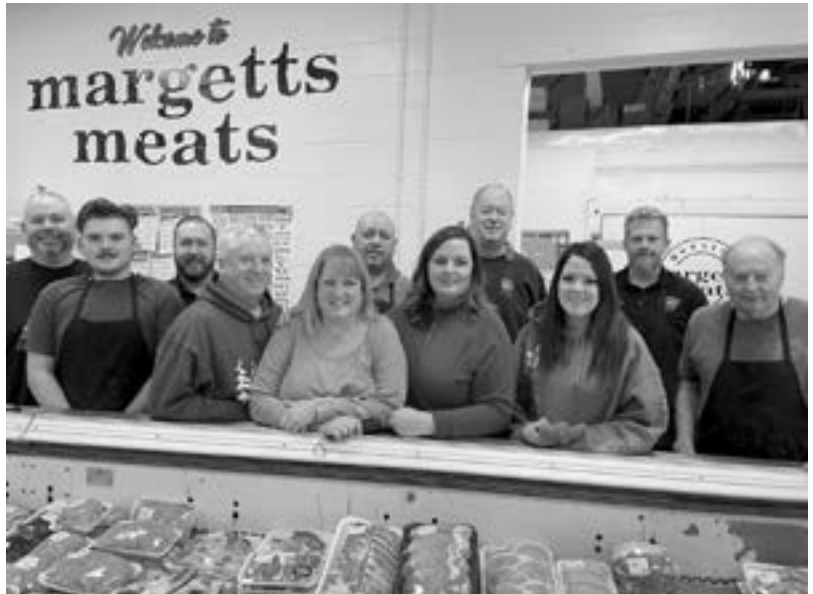
The team at Margetts will help you find the right cut for your family

The store carries many local products including honey, bread and baking, coffee, homemade meals, spices, mustards, and garlic products. There is also a special stock of South African groceries. During the summer months local farmers bring in fresh produce! The store offers milk and dairy products from Avalon dairy as