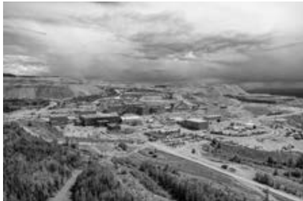
Taseko Mines - Focused on Excellence

While Taseko remains fully 'Committed to the Cariboo,' we are also standing at the threshold of