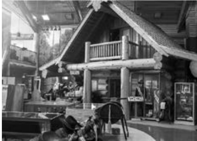
Visit the Museum year-round. The friendly staff would love to see you!

On average, the Museum gets around 2,400 visitors a year and they are always encouraging more people to come visit. The museum provides many tools to research the history in this region and offers a whole team of individuals who are willing to help anyone who walks in the door. The