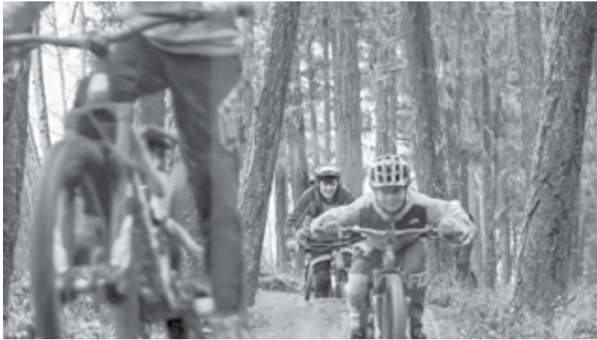
unknown riders, Fox Fire trail, Fox Mountain trail network.

The Williams Lake Cycling Club (WLCC) has been in existence since 2005 but was predated by the Puddlebike Club that had existed since the nineties. The WLCC was born of necessity as there was pressure to maintain the rogue trails that volunteers had built or face losing those trails surrounding Williams Lake. In 2008 the club entered into a maintenance agreement with the Province of BC legalizing the trails, and in 2009 became partners with the City of Williams Lake. The legal trail status and the club's agreements allowed the city to use mountain biking in their attraction and retention strategies for professionals.