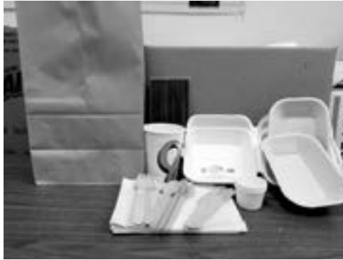
Businesses that sign up to be a Green Event Host will receive recommendations from CCCS staff for eco-friendly food packaging options, like the samples pictured here.

We joined the Chamber of Commerce as a means to make contacts within the business community. We can help your business set up green workspaces; provide staff with in-house recycling solutions, compost coaching, and water conservation education; supply water wise and waste wise office